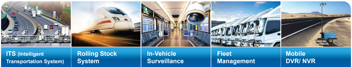
ITS (Intelligent Transportation System)